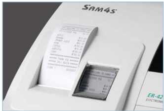
44mm Wide Thermal Receipt and Journal from Two Station Printer