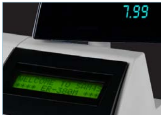
2 Line Operator Display and 10 Digit VFD Customer Display