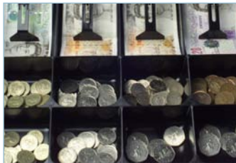
The cash drawer has four notes and eight coin compartments