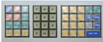
Raised keyboard provides read and point operation